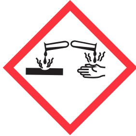
CONTAINS CHROMIUM (VI)

DANGER Causes skin irritation. Harmful if swallowed. Causes serious eye damage. May cause respiratory irritation. Keep out of reach of children. Avoid breathing dust. Wear protective gloves and eye protection. Wash hands thoroughly after handling. IF SKIN IRRITATION OCCURS: Get medical advice/attention. IF SWALLOWED: Call a poison centre or doctor/physician if you feel unwell. IF IN EYES: Rinse cautiously with water for several minutes. Remove contact lenses, if present and easy to do. Continue rinsing. Immediately call a poison centre or doctor/physician. Dispose of contents/container in accordance with local/regional regulations. Repeated exposure may cause skin dryness and cracking. CONTAINS CHROMIUM (VI) May produce an allergic reaction. To avoid risks to human health and the environment, comply with instructions for use. Safety data sheet available on request.